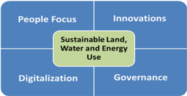
Figure 2: Key Policy Action Areas

To support this process with research based evidence, an integration and consolidation of the myriad of panels and committees at international level in an International Panel on Food, Nutrition and Agriculture (IPFNA) is suggested, partly following the design of the Intergovernmental Panel on Climate Change (IPCC). Existing organizations and mechanisms would form building blocks of such a strengthened food and agriculture governance system. Some re-design in the suggested direction was triggered by the food crisis of 2008, as indicated by the reform of the Committee on World Food Security (CFS) with its High Level Panel of Experts (HLPE), but more is needed. Moving forward, G20 may consider calling for a stakeholder forum that explores the organizational implications of such needed global governance redesign of agriculture and food.