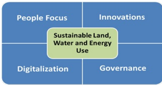
Figure 2: Key Policy Action Areas