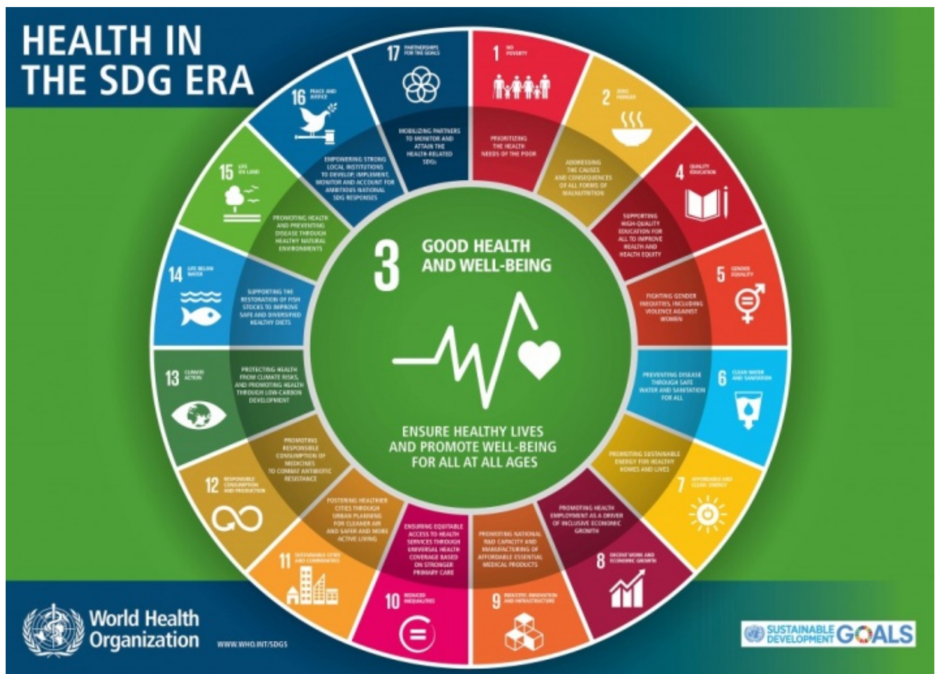
Figure 1 SDGs (WHO, www.who.int/sdg/en/ )

While the SDGs are not legally binding, governments are expected to take ownership and establish national frameworks for the achievement of the 17 Goals. Countries have the primary responsibility for follow-up and review of the progress made in implementing the Goals, which will require quality, accessible and timely data collection. Regional follow-up and review will be based on national-level analyses and contribute to follow-up and review at the global level. All goals are interrelated and are an example of interdisciplinary ambitious policy. Health is affected by and impacts on all other goals as is illustrated below.