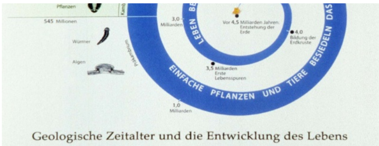
Figure 2 Evolution (Ganten, Nesse 2012)

Evolutionary medicine has thus become a precise and exact new science. We know that we cannot easily get rid of genes and structures once they are part of our genomic heritage. The more important genes are for survival and reproduction, the longer and better they are conserved in evolution. Genes which are important for basic functions are, in general, old genes. Nature is conservative; it conserves structures and genes, rather than function. Gene regulation, cell biology and cell division in humans still follow similar basic mechanism as seen in the first unicellular organisms and in archeobacteria as they existed in the beginning of life on earth 3.5 billion years ago. The same is true e.g. for muscles, bones, sensory organs the nervous and the gastro-intestinal systems. The modern human biology is very old and in many instances dates back to the origins of life. The gap between our "old" biology and our modern, fast-changing, frequently man-made new environments explains the diseases of civilization.